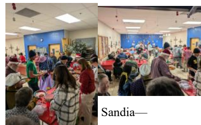
Sandia— Youth Christmas Party!!