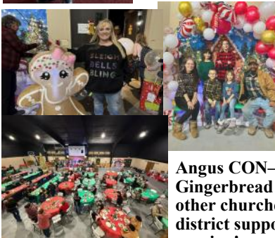
Angus CON—Annual Gingerbread BASH!!! 2 other churches on our district supported this evening!