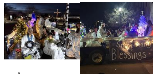
Aztec CON—Float in the "Sparkles Parade"