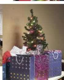
Portales— Youth Christmas party!