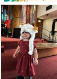
Las Cruces 1st— Childrens program and Church Christmas party